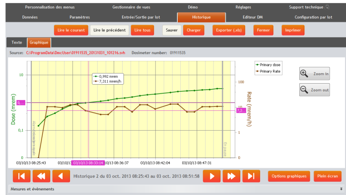
Dose measurement historical