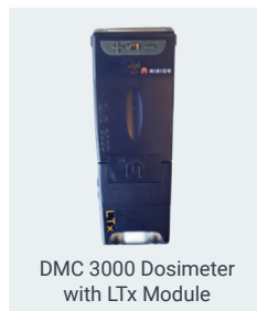
DMC 3000 Dosimeter with LTx Module

Orion RTLS utilizes the established technology of the DMC 3000™ dosimeter, fitted with an LTx module. The LTx module supports the transmission of radiological information and location coordinates, tracking the wearer's location within about one (1) meter. The LTx communicates dose rate and location data to the Orion RTLS system to facilitate real-time visualization.