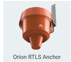
Orion RTLS Anchor

Anchors are placed throughout the monitored area to capture and relay location data to the central monitoring station. Installation is simple, using Cat5 cables utilizing Power over Ethernet (PoE). For temporary installations, each anchor has magnetic mounts for rapid deployment and removal.