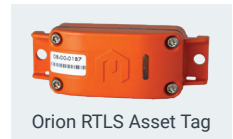
Orion RTLS Asset Tag

An asset tag can be fixed to critical spare parts, large tools and equipment to track their location throughout a monitored facility. Asset tags transmit location data, eliminating challenges caused by lost equipment. Asset tags are rugged, watertight, and offer a two-year battery life.