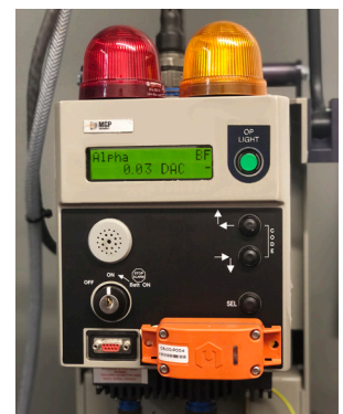
Transmitting RAMSYS ABPM with Asset Tag