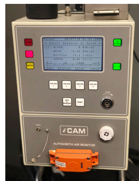
Transmitting iCAM™ monitor with Asset Tag