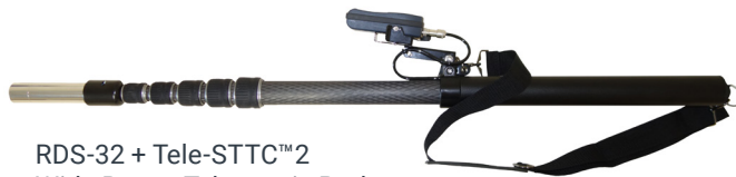
RDS-32 + Tele-STTC™2 Wide Range Telescopic Probe

*Change from GM tube to Si diode at 30 mSv/h in increasing field and back from Si diode to GM tube at 10 mSv/h in decreasing field