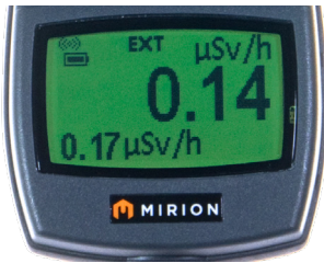
Display with Gamma Probe