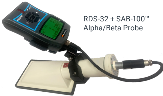
RDS-32 + SAB-100™ Alpha/Beta Probe