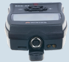
Connector, charging contacts, fixing lug for wrist strapclip