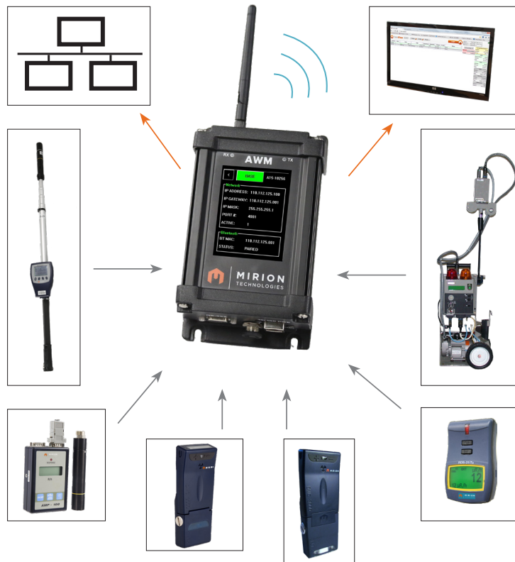
AWM and Mirion Telemetry Network