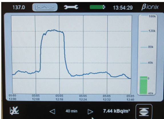
Example of the response at 100 kBq/m 3 B IONIX 3 – MES Volumetric activity measured