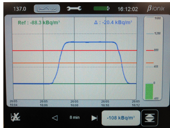
Example of the response at 10 MBq/m 3 B IONIX 3 – CMP Volumetric activity measured