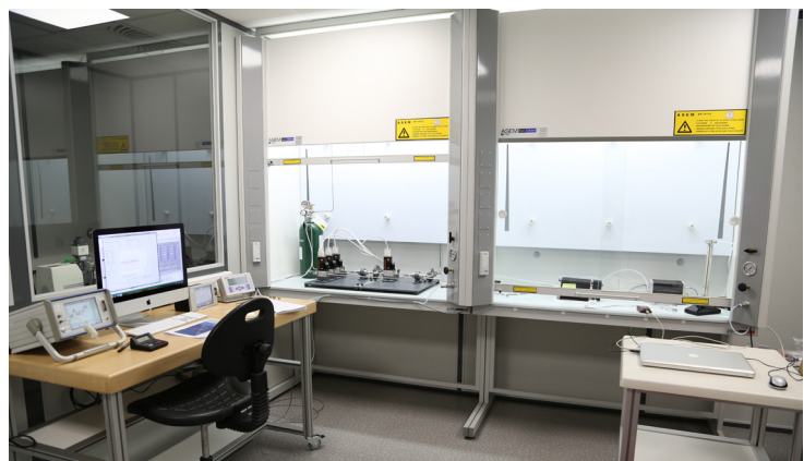
Mirion Technologies (PREMIUM Analyse) gas laboratory based on the standard NF EN 60761-1 and -5

Calibration reports available, gas calibration made upon request