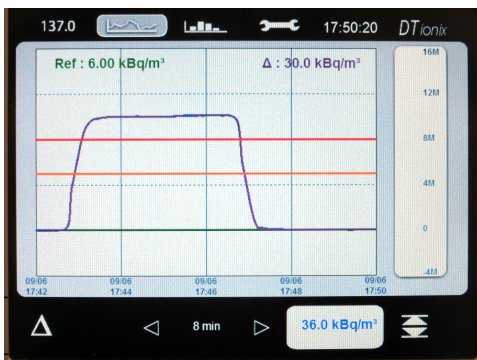
Injection of 10 MBq/m 3 (270 μCi/m 3 ) in a C IONIX 3 - BLC