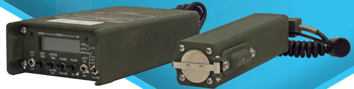
RDS-100P unit with Beta Gamma probe